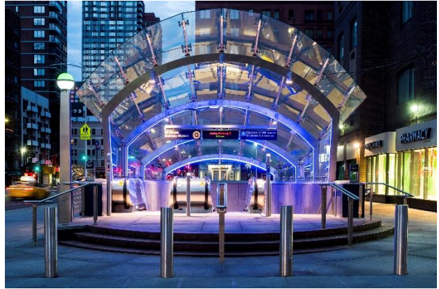
Pittsburgh (Gateway Station)